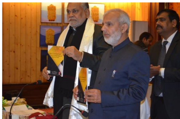
Technical Bulletin release by Hon'ble Minister