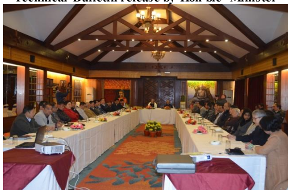
Review meeting by Shri. Parashottambhai Rupala, Hon'ble MoS Agriculture & Farmers Welfare