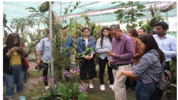
Field visit of Participants